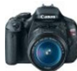
Photo session will be February 11, 2012 after the bonus session in the afternoon.

Sitting fee plus one retouched digital photo costs $100. Other larger packages are available.